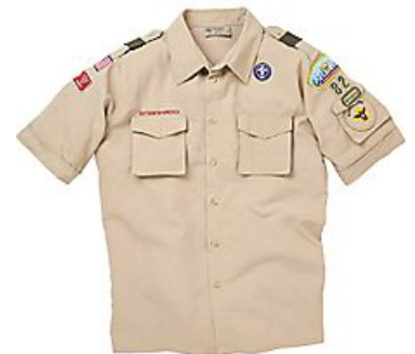
Men's/Youth Short-sleeve Cotton Rich Poplin Shirt