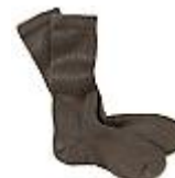
BSA Hiking Sock