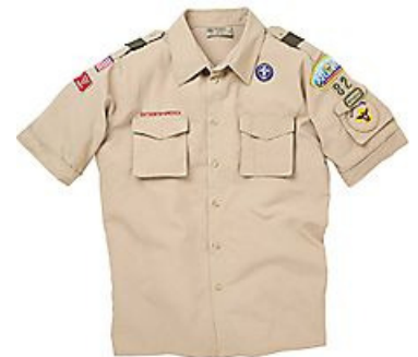
Men's/Youth Short-sleeve Cotton Rich Poplin Shirt